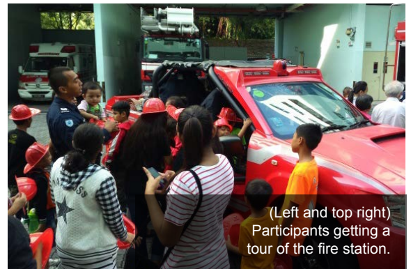
(Left and top right) Participants getting a tour of the fire station.